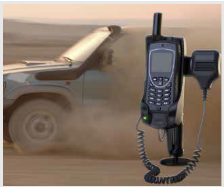
Use on the Go Great for vehicle applications such as emergency responders.