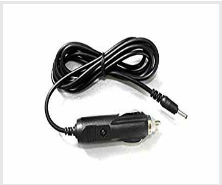
Uses the Iridium Charger Uses the 6V charger for the Iridium Extreme PTT AC/DC or cigarette lighter