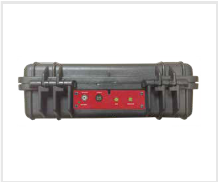
External Panel Allows for case to be closed. Charging indication easy to read.